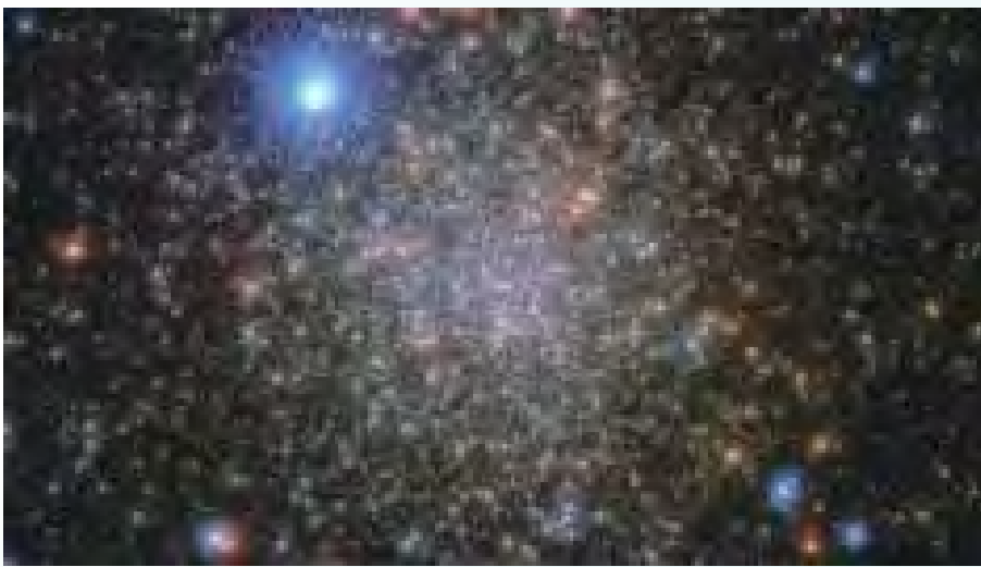
Space and the Universe

Every time technology evolves, the living quality of humans improves. In the past decades, centuries and millennia, technological developments have brought new and innovative things. For example, the breakthroughs in cultivation technology, smelting technology and industrial technology have provided us with higher productive efficiency, more durable tools and more convenient transporting methods such as vehicles. Take information technology as another example. The development of digital and electronic equipment has made communication and the dissemination of information