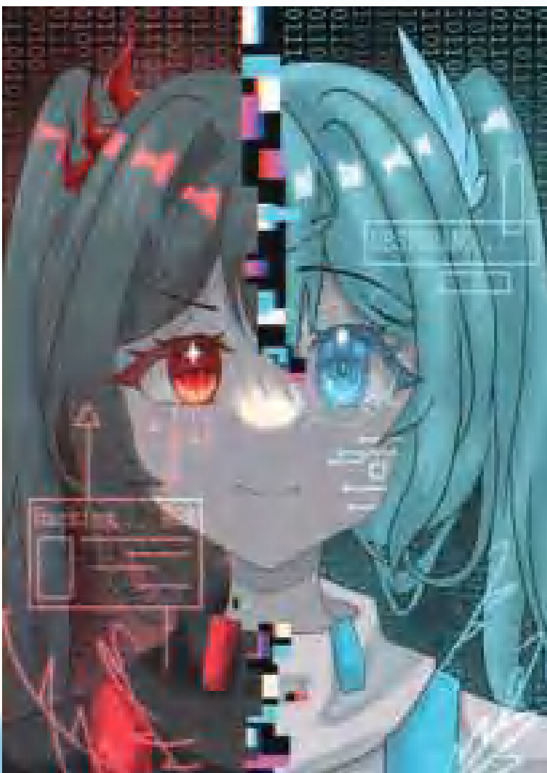
The Future Risk ~ By Eva Ho (4A)

Second, artificial intelligence (AI) is intertwined with advanced technology. It can take away some easy and boring jobs such as factory assembly and cleaning. These jobs are usually labour intensive or are very physically consuming, so it will be convenient for people when machines take up those jobs to serve us. Although technology helps us to live more easily and conveniently, big and small problems will occur if we overuse it. If AI replaces humans for work, people may become lazy and refuse to find a job. A high unemployment rate will result, and employers will make more money using AI instead of human labour. It can help increase productivity and reduce production costs. While workers replaced by AI may be unable to find a new job because of their lower education level, the difference between the rich and the poor may widen. It may result in social problems like demonstrations and higher crime rates. The above things will destroy social harmony and society.