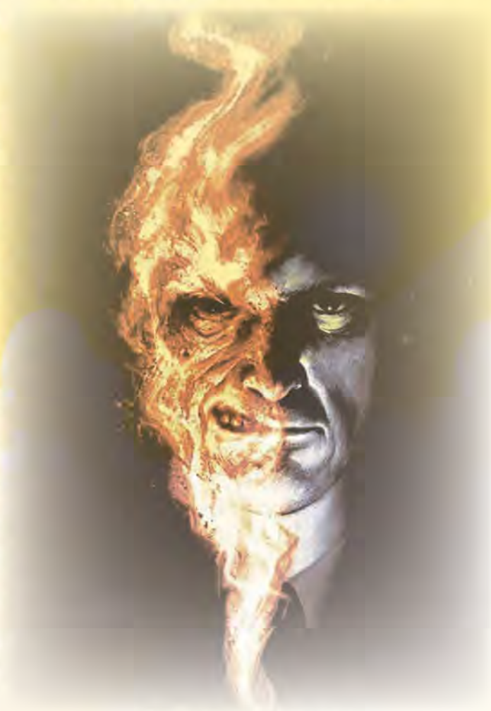
Dr. Jekyll and Mr. Hycle

How one behaves is subject to change due to environmental factors, such as an abusive childhood, or social interaction with families or peers. For children, unmet physical or mental needs are often triggers for behaviours of concern. For instance, a hungry child may become irritable or disruptive, while a loveless child may throw tantrums or become uncooperative. When they grow up, they may encounter problems in socializing or regulating their emotions. Feelings of isolation, neglect, or lack of a supportive social network can lead to aggression, withdrawal or depression. As a result, the environment may play a role to change a good person into an evil one.